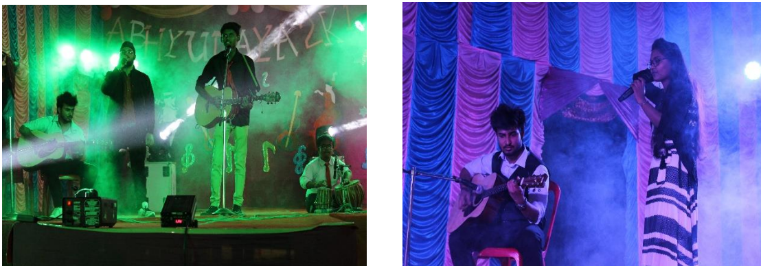
Figure 3: Cultural program by students

Various cultural events have been organized such as Ek Bharat Shreshtha Bharat (EBSB) Cultural Day, 21 st March, 2018; EPISTEME 2K18 – 2 nd and 3 rd September, 2018; and Teachers' Day celebrations 2015, 2016, 2017, 2018