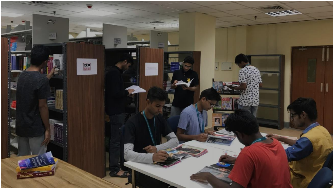
Figure 4: Students studying at library

In addition, the institute houses newspapers and magazines in the library. The students are issued 5 books at a time and on request extra books are also issued with special permission from Faculty-in-charge.