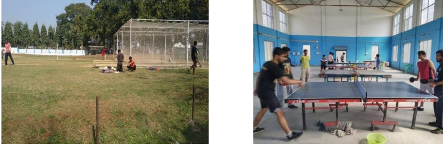
Figure 2: Students playing outdoor and indoor games at Kalyani Stadium

Under Gymkhana, students also have following clubs for nurturing various extra-curricular and cultural activities such as Film and media club (FMC); drama club (SEMBALANCE); and club for dance and beats (groovZ).