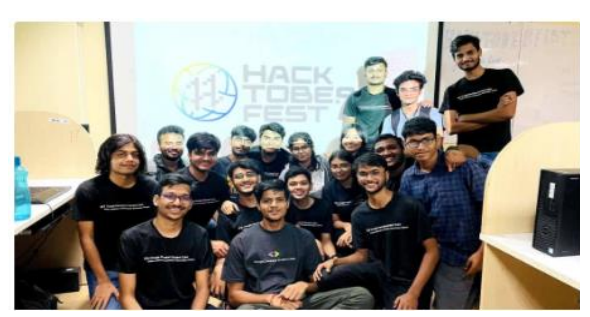
Hacktoberfest at IIIT Kalyani