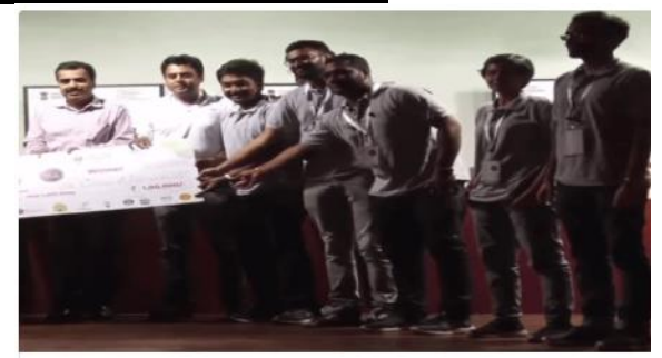
Smart India Hackathon 2022 Winners