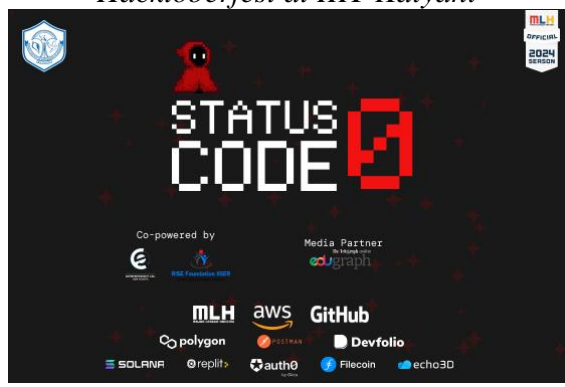
First Hackathon organized by IIIT Kalyani