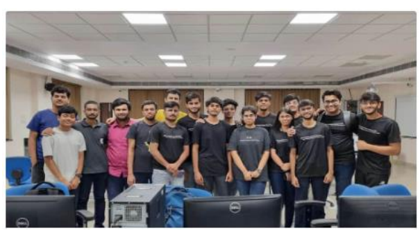
Hacktoberfest at IISER Kolkata