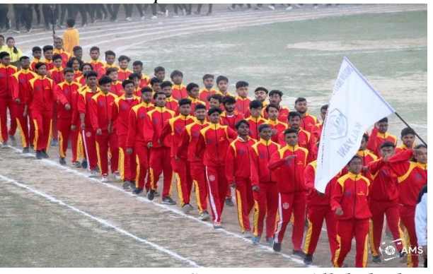
Team at Inter IIIT Sports Meet, Allahabad

<u>UG Seat Matrix:</u> The institute offers undergraduate admissions to the B. Tech courses on Computer Science and Engineering and Electronics and Communication Engineering . The present seat matrix layout for the courses is as follows.